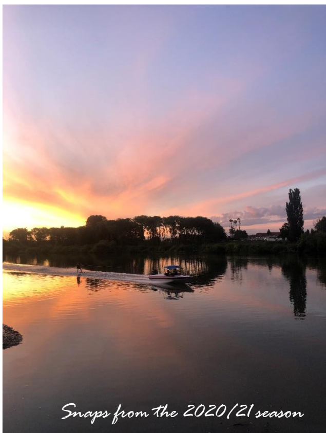
Snaps from the 2020/21 season